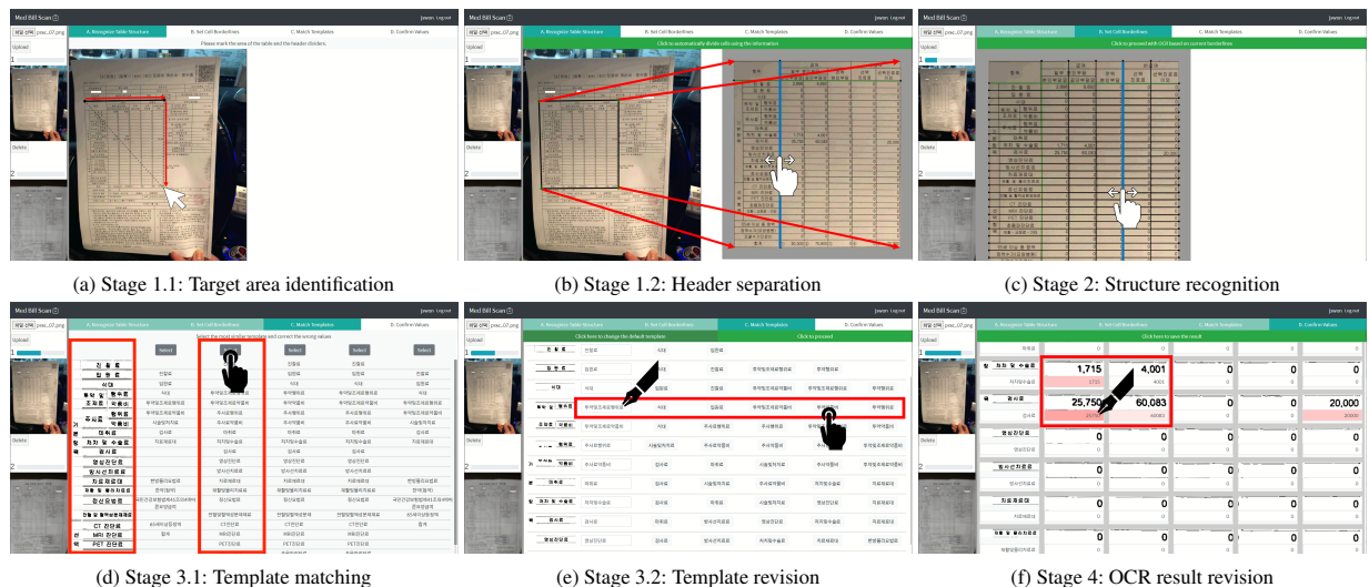
Figure 2: Figures describing stages of the mixed-initiative pipeline. (a) Users can select the target image at the left component. The selected image appears at the right component. With a mouse click, users can draw a quadrangle surrounding the target area. (b) Users can add one horizontal line and one vertical line respectively to distinguish header cells from others. (c) Based on lines that the automated model predicted, users can modify each line. Also, users can select multiple lines with drag & drop interaction and manipulate them simultaneously. (d) The automated model extracts data from the divided cells with the OCR module. With Case-based reasoning, five candidates of the template are given. Users can choose the most similar candidate among the candidates. (e) After selecting the candidate template, users can modify minor errors of header values. (f) Finally, users modify money amount values and submit the result.

of the users, the system highlights cells that have low prediction confidence (Figure 2f).